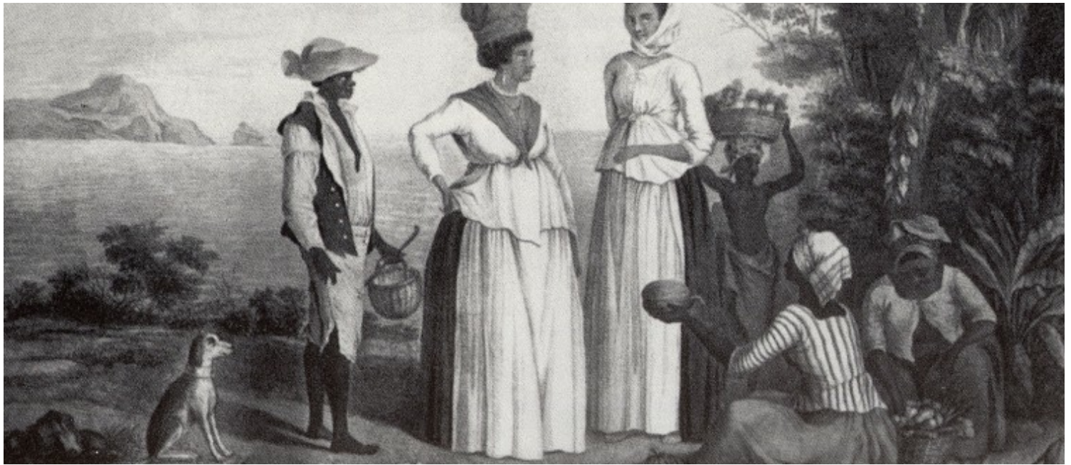
Agostino Brunias, 'The Fruit Market at St. Vincent', engraving, 1770s